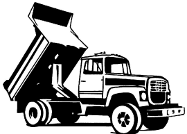
Single Axle Dump